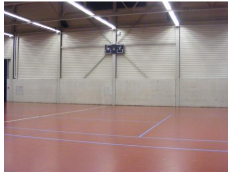
Electronic Scoreboard (Temporary)