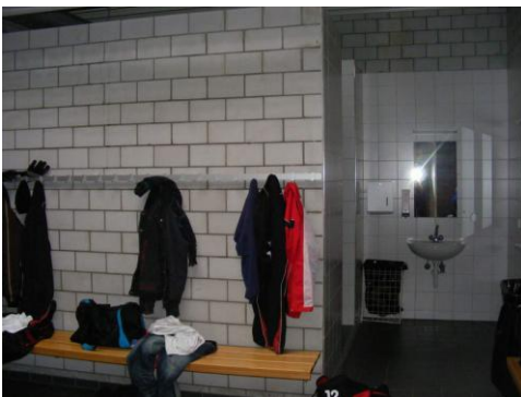
Upstairs Changing room (Typical)