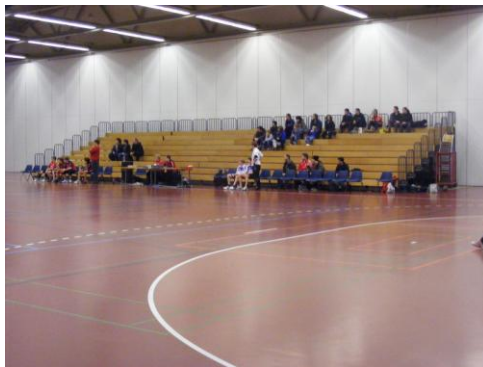
Substitution area and timekeeper table