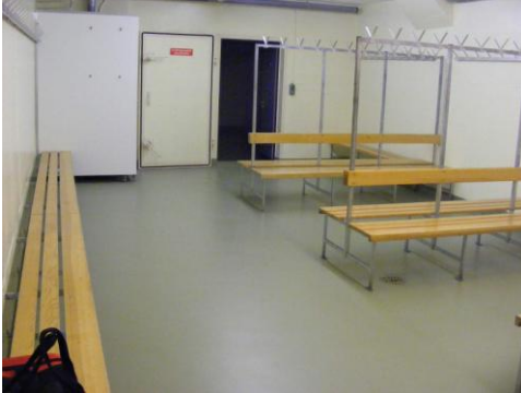
Basement Changing room (Typical)

There are 10 changing rooms and they are interlinks with both Sports Halls (Hall 1, 2 and 3) from basement and upstairs.