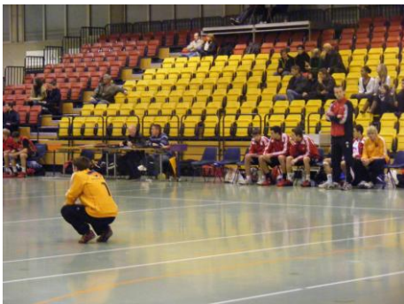
Substitution area and Timekeeper table