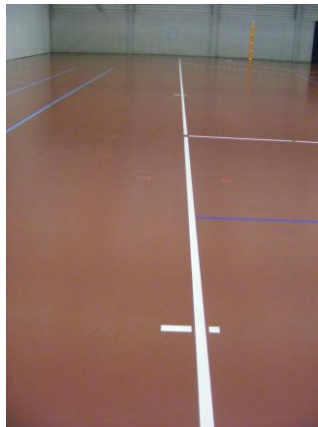
Substitution area and Timekeeper table