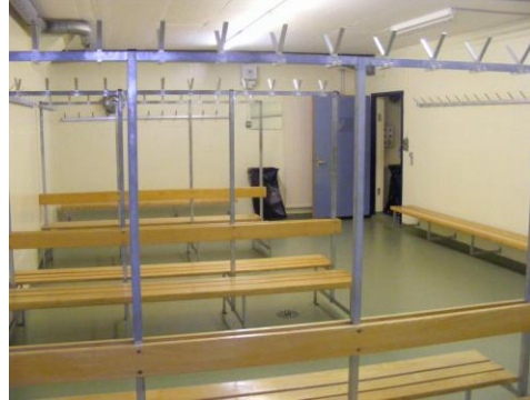
Basement Changing Room (Typical)