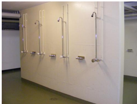
Shared Shower room