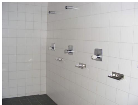
Upstairs Shower Room (Typical)